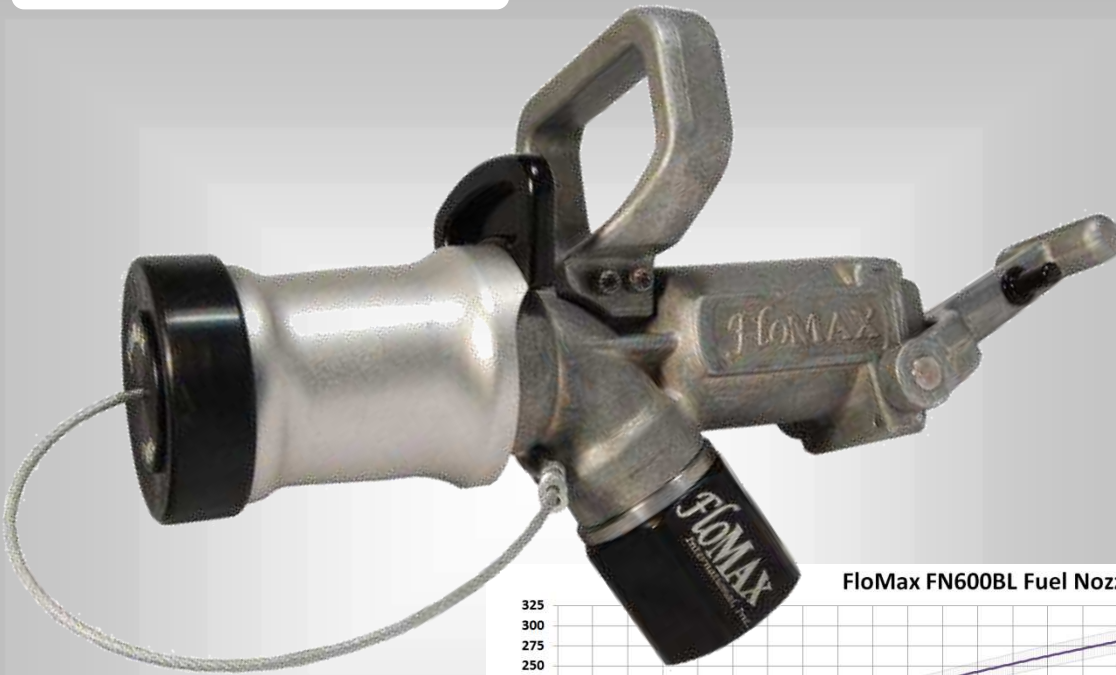
FloMax FN600BL Fuel Nozzle

Based on lifespan tracking data, it is cost effective to rebuild a FloMAX nozzle up to three times. FlowTech tracks all fuel nozzles by serial number. To ensure quality control all nozzles are bench tested for flowrate & pressure following rebuild and before being returned to the customer.